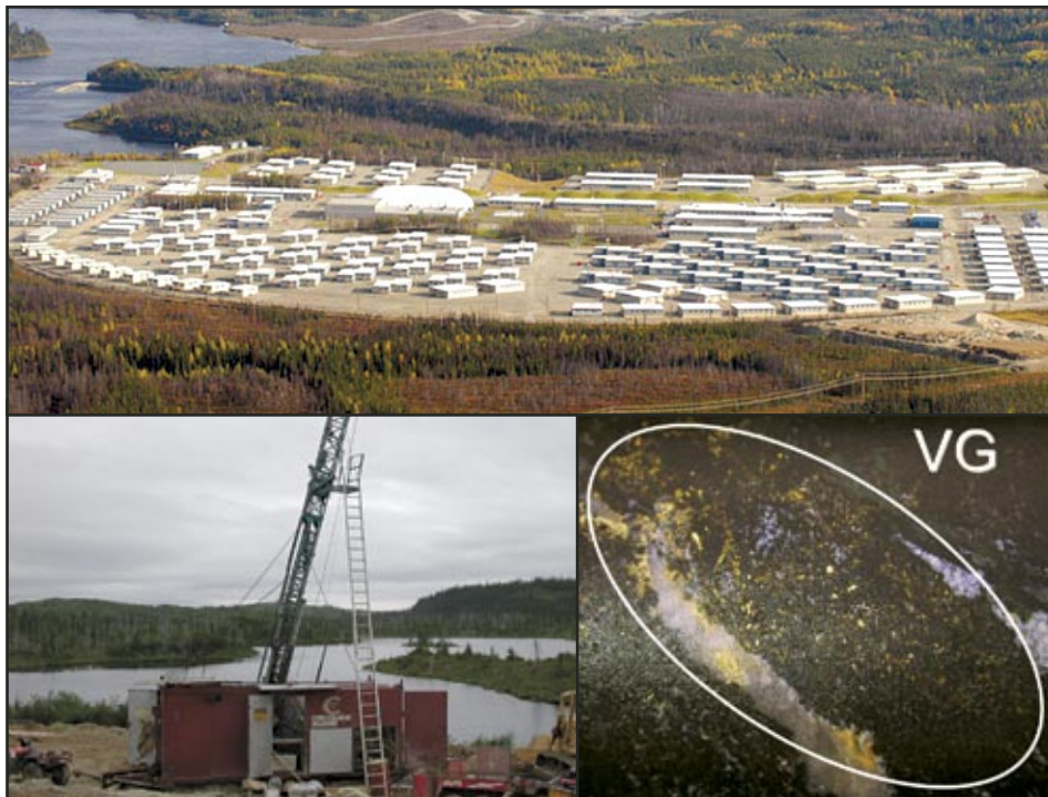
The 2007 drilling program at Eastmain's Clearwater Project just miles from Hydro Québec (top), yielded 180 ore intercepts, 55 with visible gold (above right) and surface grades of 23.5 g/t.

A Hydro Québec power connection is within 3 miles of the project and